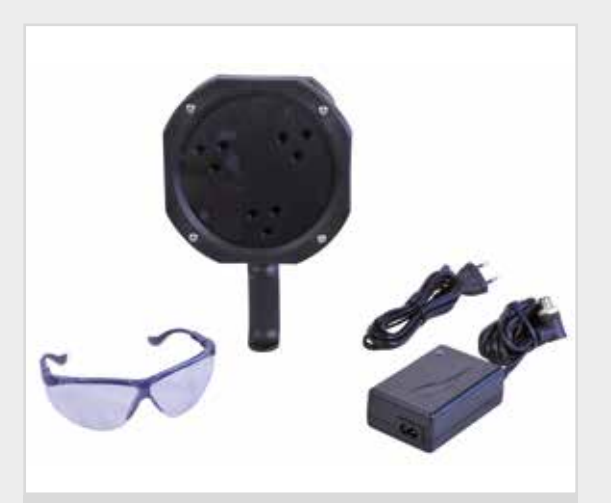
BATTERY VERSION PACKAGE INCLUDES: Lamp, UV Block Goggles, Power supply for charging batteries while operating.

The mains version can be mounted on a cable winder with a 9.5 meter (31 feet) cable.