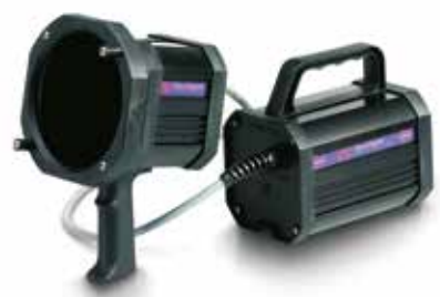
DUO PS135 – PISTOL HANDLE SHORT Two-part lamp consisting of a light weight luminary unit with pistol handle and a ballast (electronics) unit can be selected.