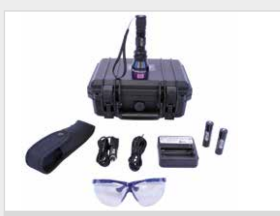
UVG3 KIT (SINGLE) PACKAGE INCLUDES: Lamp, Car Charger, Two Batteries, UV Block Goggles, External Charger for wall outlet, carrying case, belt holster, wrist band.

UVG Series products UVG3 and UVG5 are small and compact lights with a powerful output that offer convenience during quick inspections. UVG3 torch weighs just 211 grams (7.4 oz) and the UVG5 headlight weighs just 271 grams (9.4 oz). The UVG Series family of products has been specifically designed to meet the ASTM E3022-15 and ISO 3059-12 standards as well as requirements set by the PRIMES.