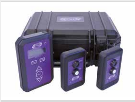
APOLLO 1.0 DOUBLE KIT PACKAGE INCLUDES: Reader unit, two sensor units, Calibration certificate, Carrying case.