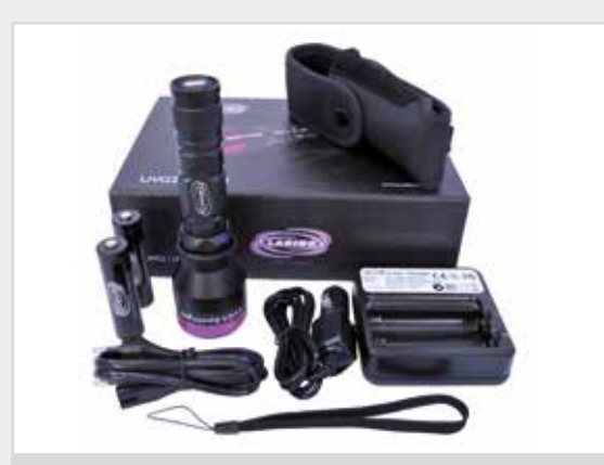
UVG3 TORCH PACKAGE INCLUDES: Lamp, Car Charger, Two Batteries, External Charger for wall outlet, belt holster, wrist band.

UVG3 torches can be mounted on a Labino tripod.