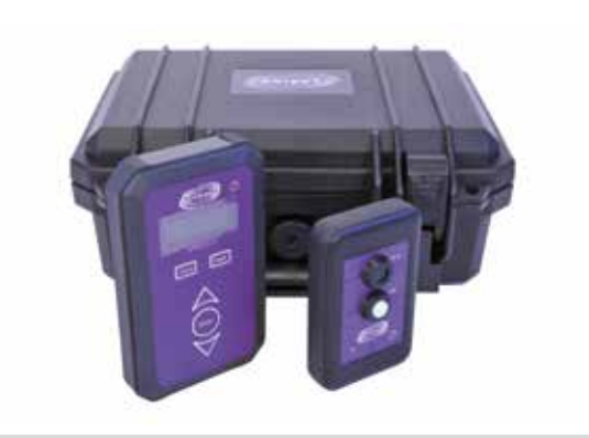
APOLLO 1.0 SINGLE KIT PACKAGE INCLUDES: Reader unit, Sensor unit, Calibration certificate, Carrying case.